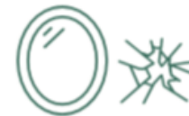
Window glass and mirrors (glass only no frames)