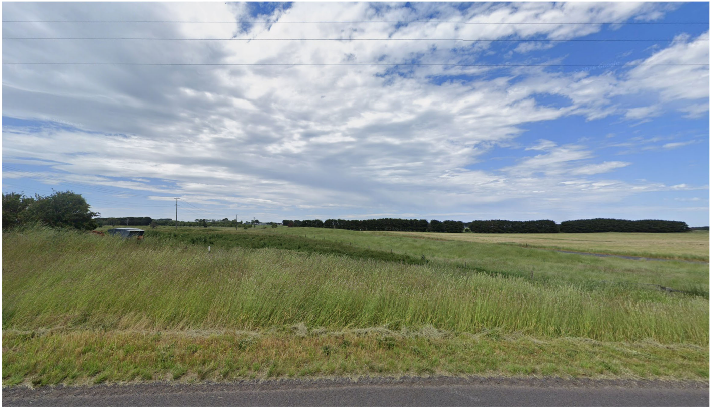
Looking West from Mortlake Framlingham Road