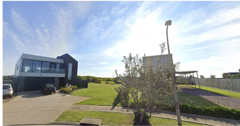
Figure 2 – Low threat vegetation in the surrounding township area.