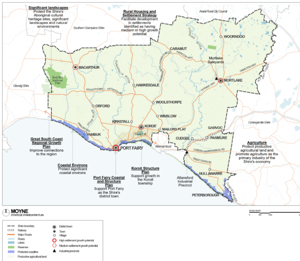
Figure 2: Moyno Strategic Framework Plan