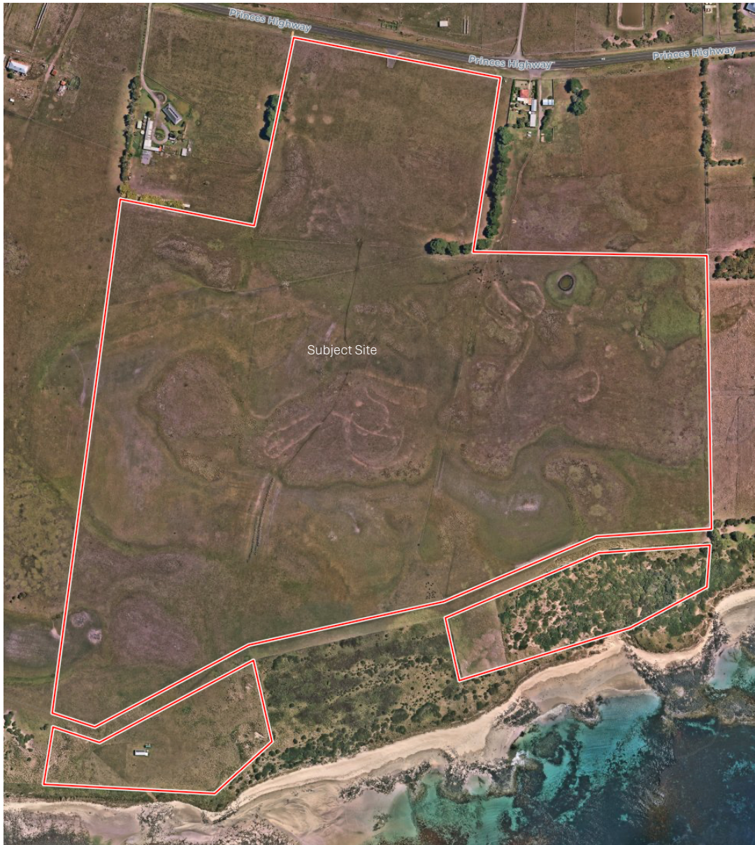
Figure 1: Aerial Plan