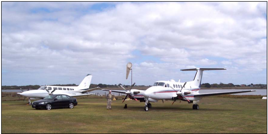
Cessna Titan & Beechcraft KingAir at Port Fairy ALA 19 Mar 2007