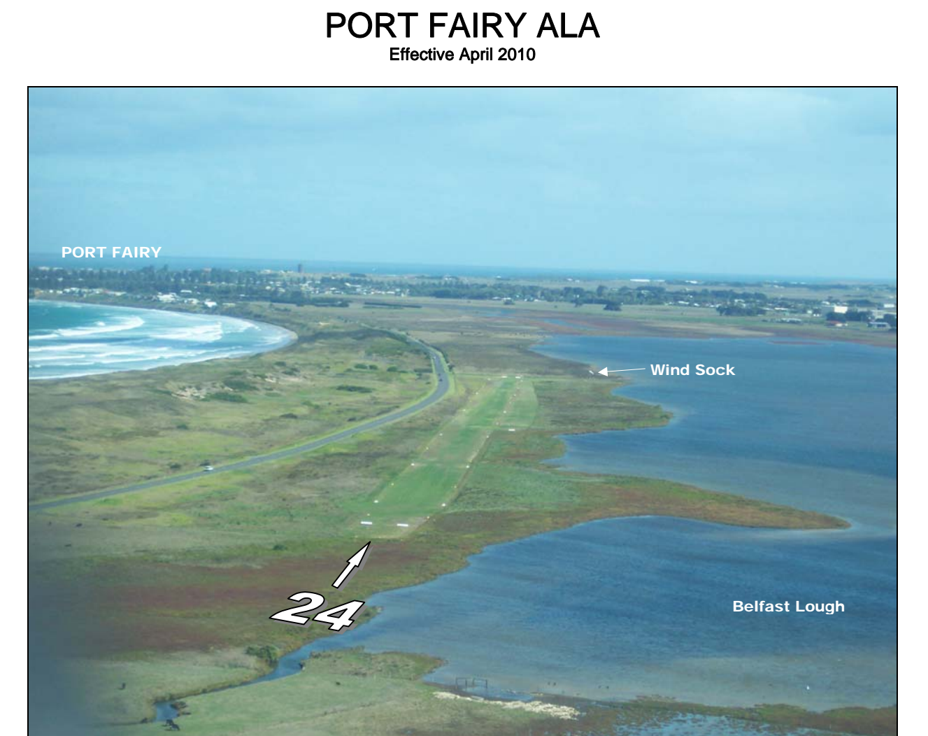
View approach RWY 24