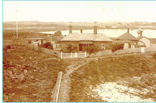
The Keepers' quarters, from the lighthouse c. 1936. The Flagstaff and code house (left rear) with sheds and some Shiny leaf shrubs. Note the windmill (right) for raising subterranean water.

The structure of the lighthouse tower is intact, with the addition of the stone causeway in 1864 (to counter high seas) and, although the clockwork mechanism has been removed, the original lens and cabinet, mahogany lining and imported cupola remain. A modern light which is solar powered and remotely monitored was fitted externally in 2006. The tower is protected (with the whole of Griffiths Island) by inclusion on the Victorian Heritage Register, and it is Classified by the National Trust of Australia (Victoria) and recorded on the Australian Heritage Register. Subject to extreme heat or wet weather it is regularly open for visitors during weekends in January, and some long weekends.