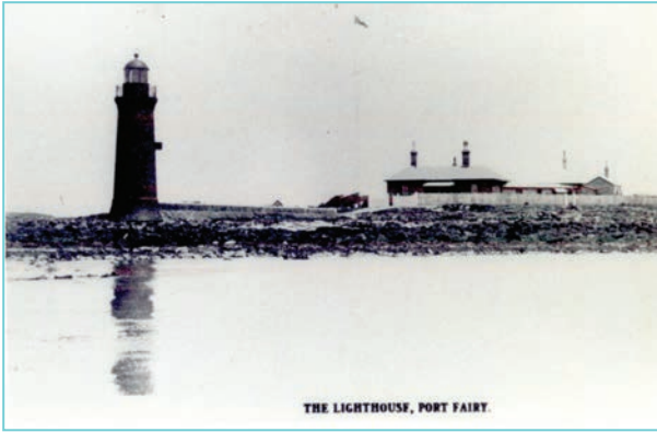
The lighthouse and Keepers' quarters, bare surrounds and red painted tower and fence c. 1920.

The Keepers' quarters were demolished because of vandalism in 1956, the stone re-used to level the training walls and the new Harbour Master had a house in town.