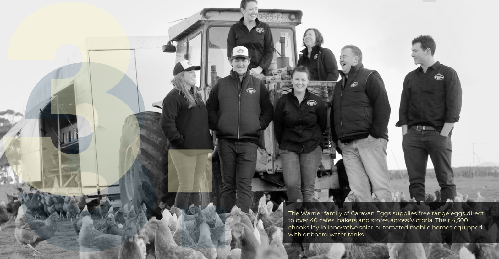
The Warner family of Caravan Eggs supplies free range eggs direct to over 40 cafes, bakers and stores across Victoria. Their 4,500 chooks lay in innovative solar-automated mobile homes equipped with onboard water tanks.